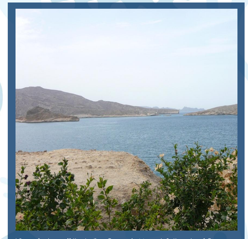
View of a bay off the Indian Ocean in Muscat, Sultanate of Oman, the site of the Marine Invasive Species: Management of Ballast Water and Other Vectors International conference, February 2014.

We would like to thank all of our supporters from the past 20 years and we look forward to many more.